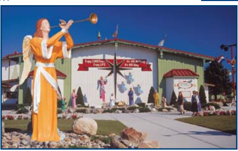
Heralding Angels welcome you to Bronner's (West Entrance shown)

Please note that Bronner's has 2 checkouts and 2 entrances/exits (South and West).